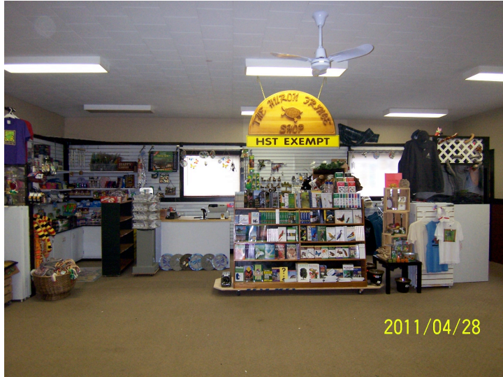
Renovations to Huron Fringe Shop nearly complete.