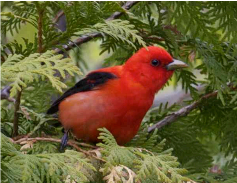
A male Scarlet Tanager returns to the Saugeen Shores area last week.